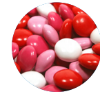
CONFECTIONERY & BAKED GOODS