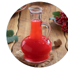
SAVORY SAUCES, DIPS & MARINADES