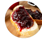
JAMS & JELLIES